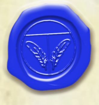
Chronicler, Barony of Dreiburgen