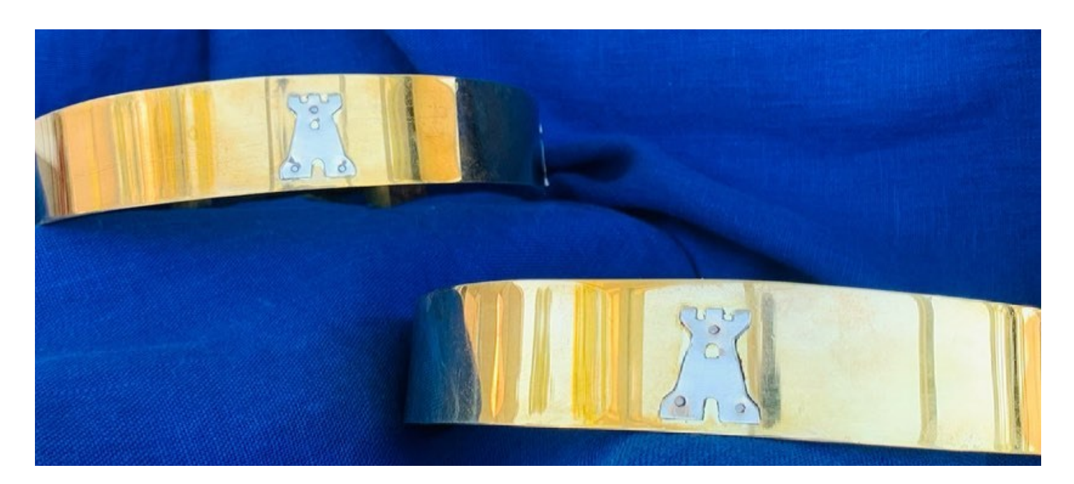
"Together we are learning from the past, invested in the present,

If something is happening in Dreiburgen, they want to participate! If someone has an idea, they are avid supporters! In Dreiburgen and the lands beyond, they have discovered what "chosen family" means. Their personal lives are greatly enriched by serving and playing in this exciting, engaging community. Above all else, they want new and existing members to experience the same sense of belonging, and be inspired to play. They are dedicated to helping the people of Dreiburgen bring their Dream into reality.